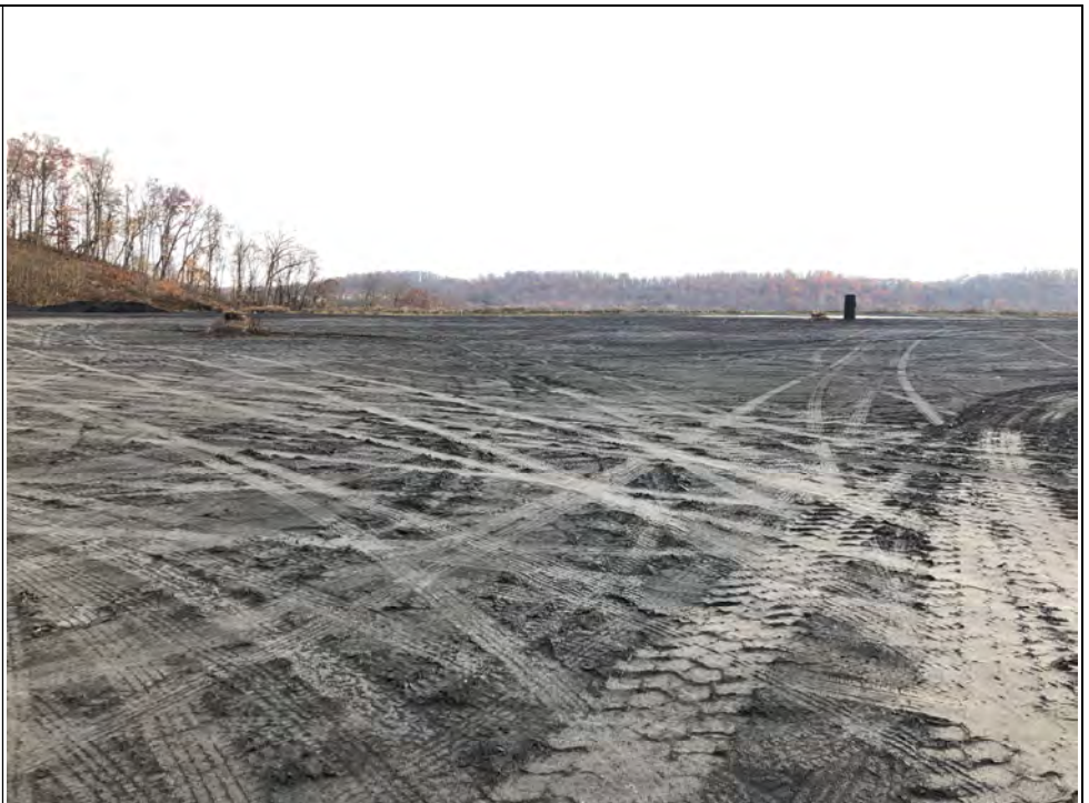
Image: 8026 Date: 11/12/2020 Time: 7:34 AM Direction: Southwest Description: A junction box lid and riser are being fabricated to extend a non-contact stormwater pipe (see Image 8028 for location where this will be installed).

Image: 8024 Date: 11/12/2020 Time: 7:34 AM Direction: East-Northeast Description: Active area. Material is placed in even lifts that are spread and compacted. Top surface is well maintained, with no ponding water.