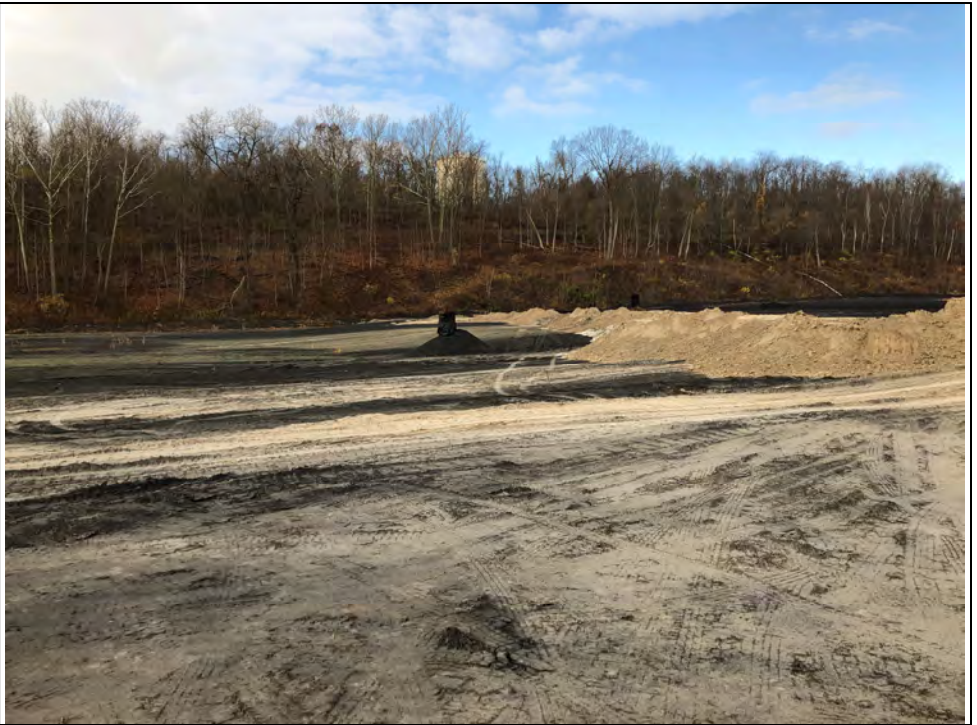
Image: 8072 Date: 11/12/2020 Time: 7:47 AM Direction: South-Southwest Description: Active area drains toward low area near treeline. No standing water is present.

Image: 8070 Date: 11/12/2020 Time: 7:47 AM Direction: West Description: Active area with recently received loads of gypsum.