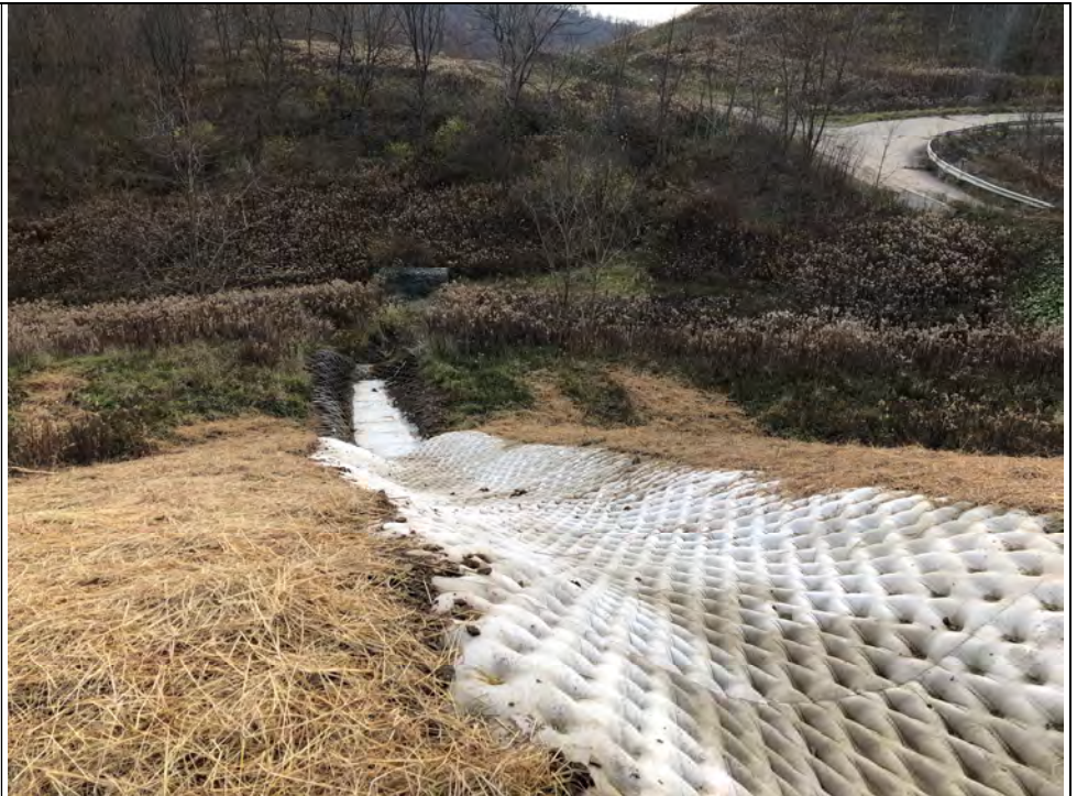
Image: 8068 Date: 11/12/2020 Time: 7:47 AM Direction: West-Northwest

Recently installed revetment matting. This matting will be used to convey non-contact stormwater that falls on the closed landfill sideslope to Outfall 011.