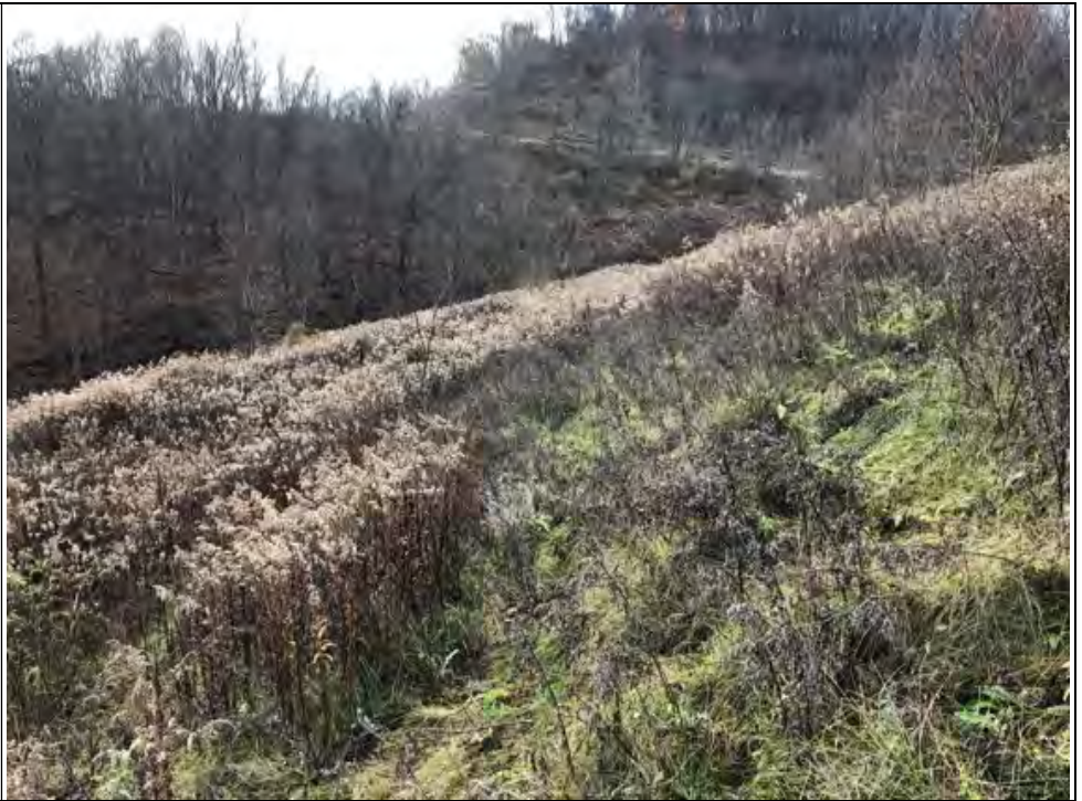
Image: 8060 Date: 11/12/2020 Time: 7:45 AM Direction: South-Southeast Description: Vegetation on sideslopes is healthy and present across the entire sideslope. No evidence of erosion, sloughing, or indications of stability issues.

Image: 8058 Date: 11/12/2020 Time: 7:43 AM Direction: Southeast Description: Vegetation on sideslopes is healthy and present across the entire sideslope. No evidence of erosion, sloughing, or indications of stability issues.