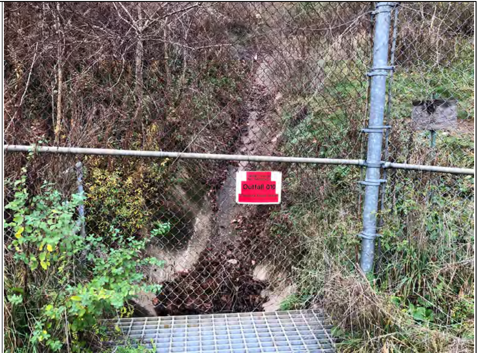
Image: 8001 Date: 11/12/2020 Time: 7:12 AM Direction: West-Southwest

North non-contact water channel (at Outfall 010) inlet to Sedimentation Pond looking upslope. Some leaves are present in channel, which are regularly removed during autumn. Functioning as intended.