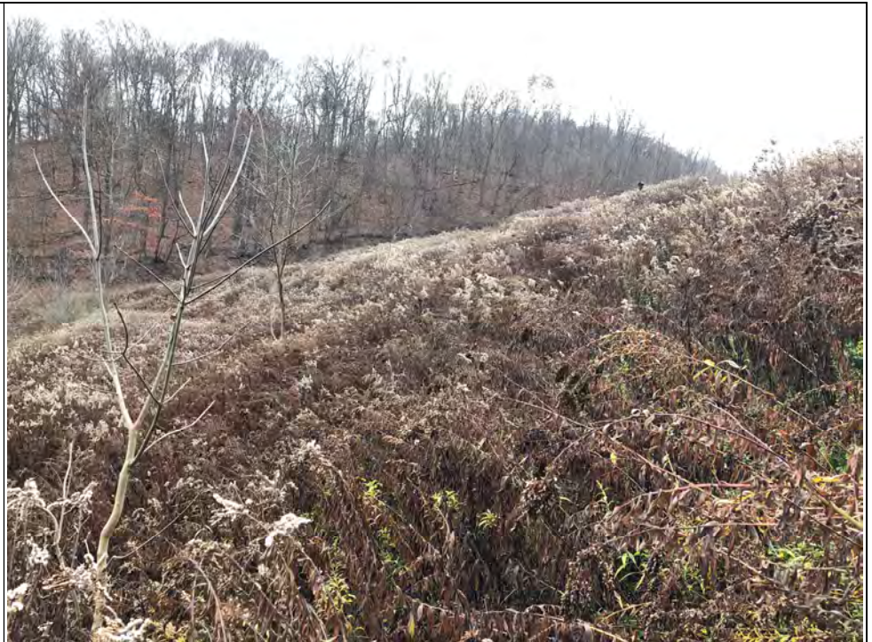
Image: 8014 Date: 11/12/2020 Time: 7:17 AM Direction: Southwest Description: Vegetation is healthy and present across the entire sideslope. No evidence of erosion, sloughing, or indications of stability issues.

Image: 8012 Date: 11/12/2020 Time: 7:17 AM Direction: South Description: Vegetation is healthy and present across the entire sideslope. No evidence of erosion, sloughing, or indications of stability issues.