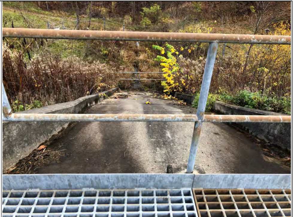
Image: 8010 Date: 11/12/2020 Time: 7:15 AM Direction: West Description: Overview of landfill. Vegetation is healthy with no identified distressed vegetation areas.

Image: 8008 Date: 11/12/2020 Time: 7:15 AM Direction: Northeast Description: View of Sedimentation Pond spillway from above. Clear and in good condition.