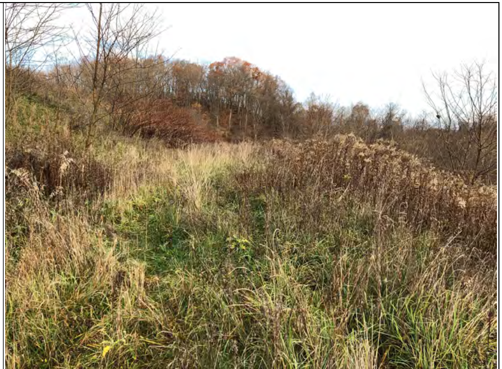
Image: 8048 Date: 11/12/2020 Time: 7:41 AM Direction: Southeast Description: Vegetation is healthy and present across the entire sideslope. No evidence of erosion, sloughing, or indications of stability issues.

Image: 8046 Date: 11/12/2020 Time: 7:41 AM Direction: North-Northwest Description: Vegetation is healthy and present across the entire sideslope. No evidence of erosion, sloughing, or indications of stability issues. Some woody vegetation is present.