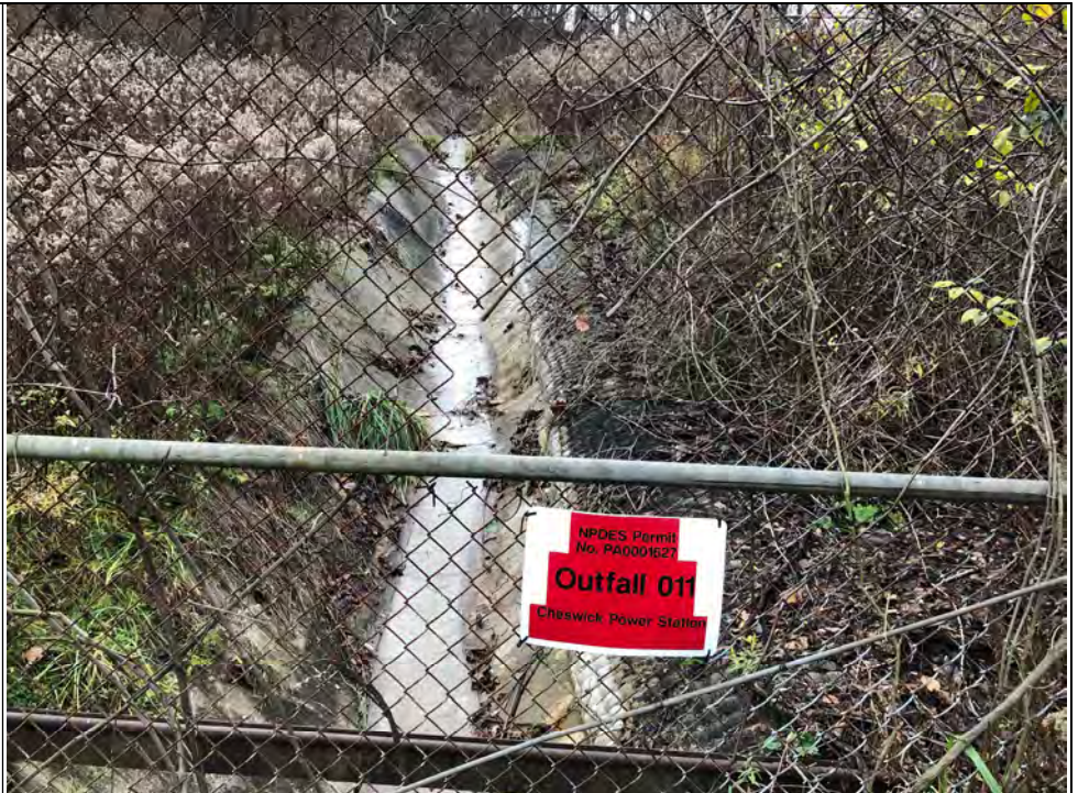
Image: 8005 Date: 11/12/2020 Time: 7:13 AM Direction: North-Northeast Description: Outfall 011 inlet to Sedimentation Pond looking downslope. Concrete flume has minor leaves and autumnal debris, which are regularly removed. Functioning as intended.

Image: 8003 Date: 11/12/2020 Time: 7:12 AM Direction: Southwest Description: South non-contact water channel (at Outfall 011) inlet to Sedimentation Pond looking upslope. Clear of debris. Functioning as intended.